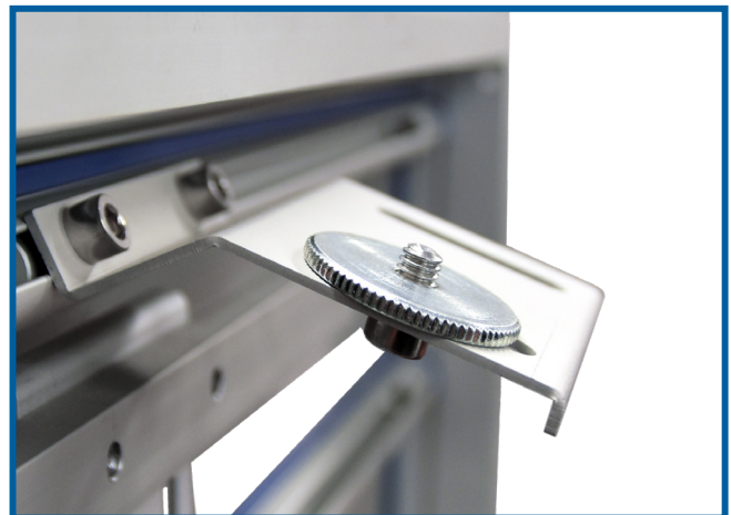
First blade has adjustable counterbalance.